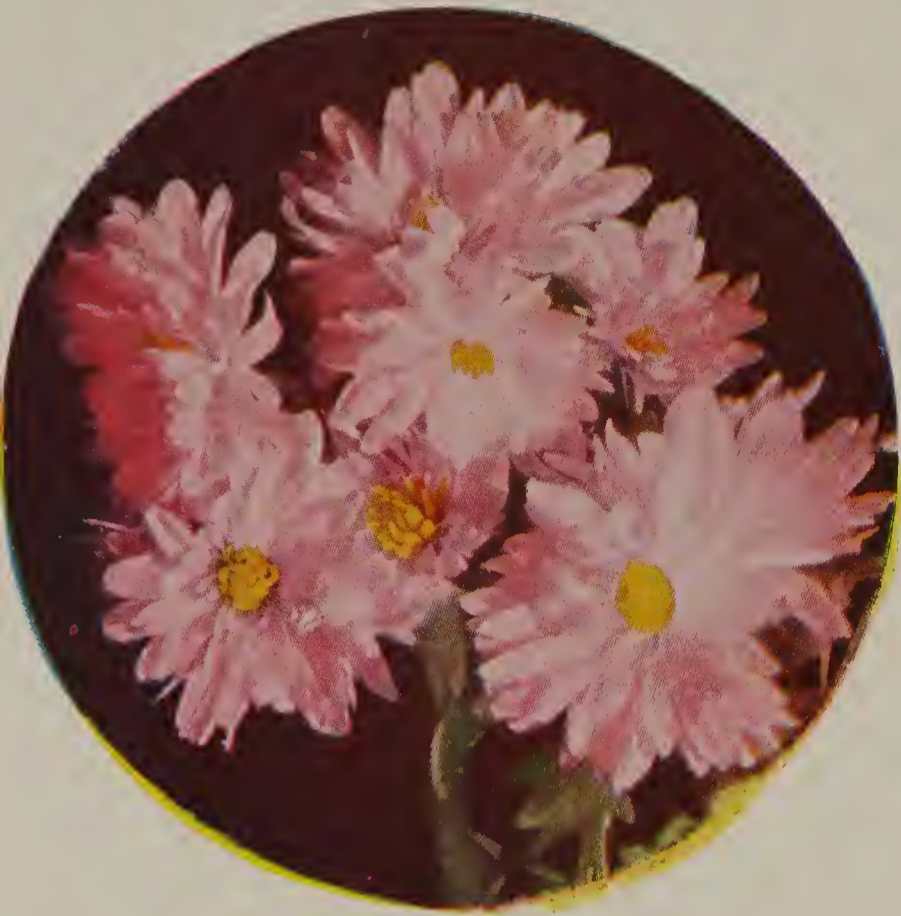
DWARF EARLY-FLOWERING OR CUSHION-TYPE CHRYSANTHEMUM